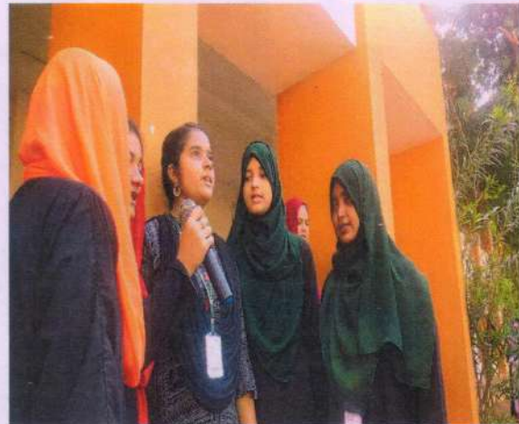
Flag song was sung by students