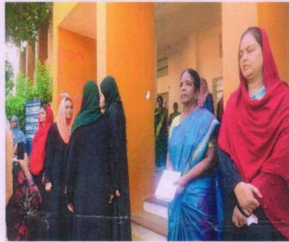
Tamil Thai Valthu was sung by students