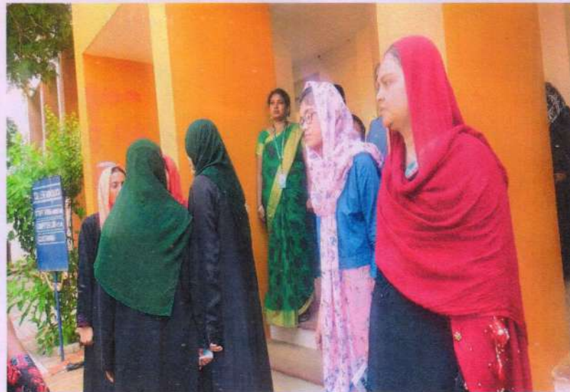
National Anthem was sung by students