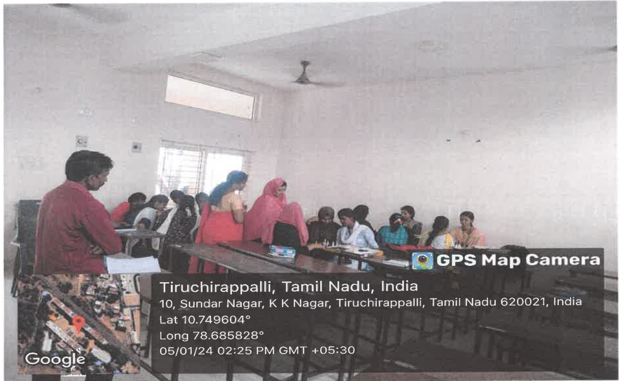
Director Madam Visit the Program